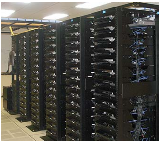
Examples of pioneering companies using only off the shelf IT can be found worldwide

The editing and finishing market is now dominated by software only products running on off the shelf Windows, Linux and Mac platforms. Most of the vendors who previously sold turnkey editing or finishing systems now offer software only. This market is moving away from video to file based operation. This is true for everything from craft editing systems, through to workflow tools like Transcoders, standards converters and watermarking systems.