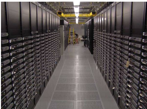
Where have all the traditional products gone? Many companies have already moved to IT.

Is that statement right? This is an important question for our industry, as we try to adapt to a new business climate. Let's take a look at the evidence: